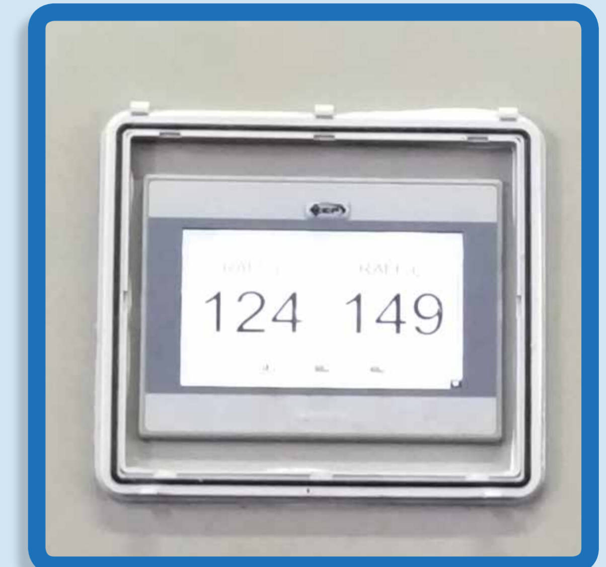
CONTROL OF INTENSITY