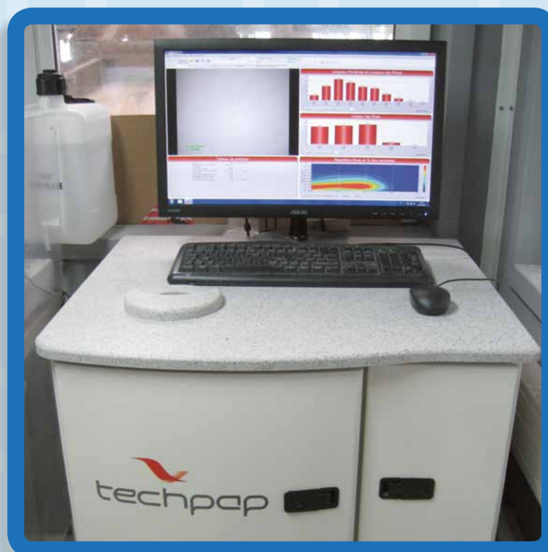
PRODUCTION FIBER LENGTH ANALYSER

IN MANUCO WE ALWAYS USE 10 CONICAL REFINERS IN SERIES