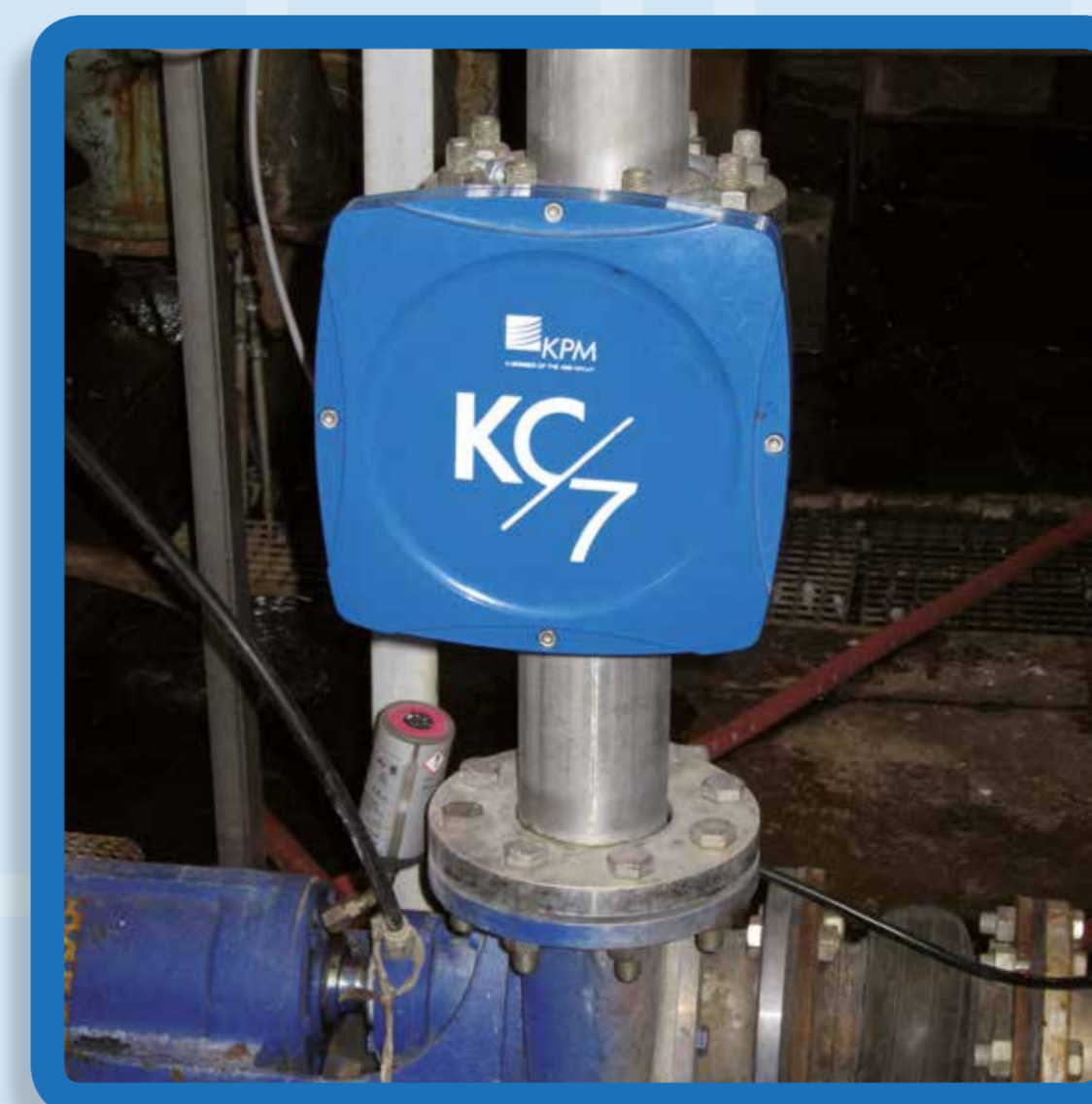
CONTROL OF CONCENTRATION