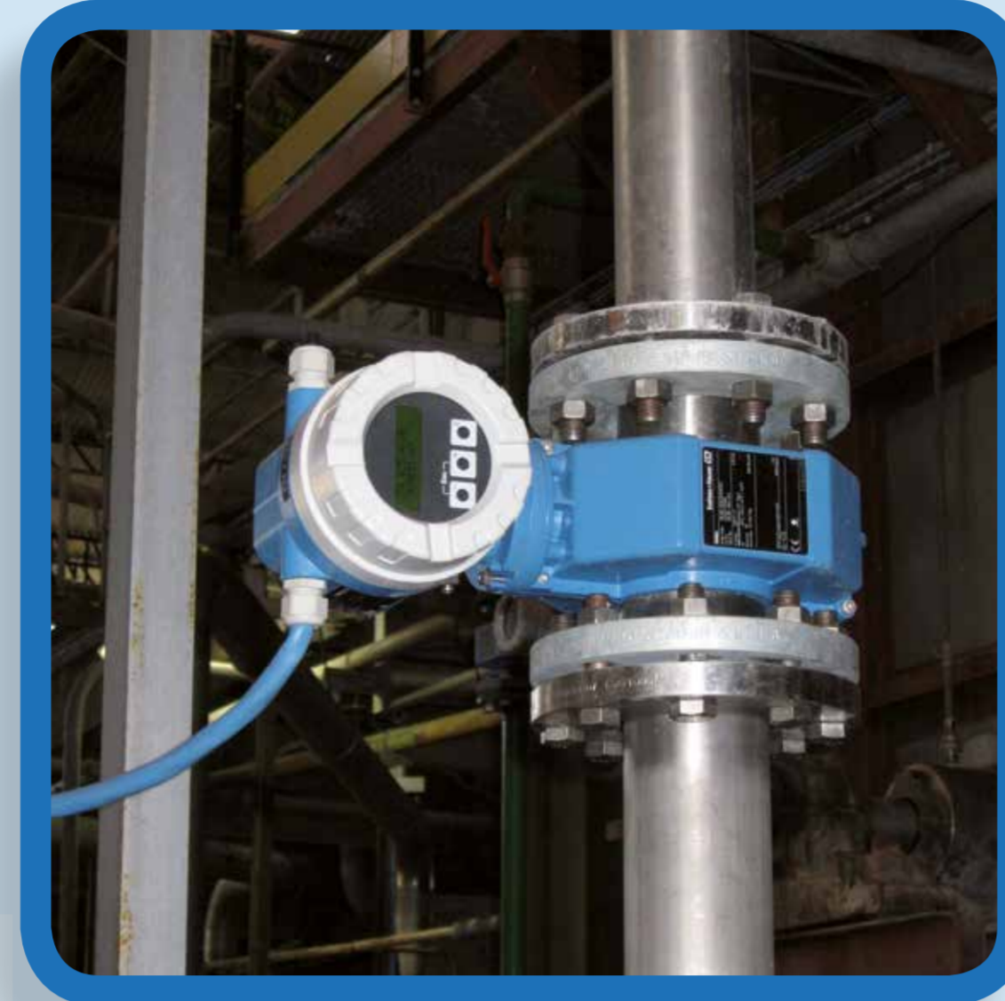
FLOW METER CONTROL